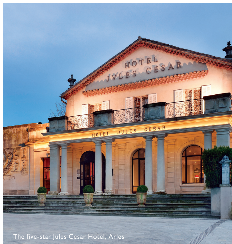
The five-star Jules Cesar Hotel, Arles