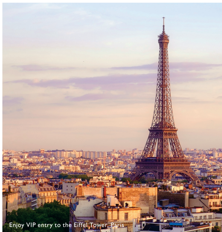
Enjoy VIP entry to the Eiffel Tower, Paris