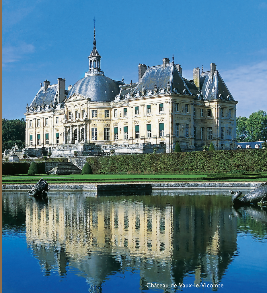
Château de Vaux-le-Vicomte