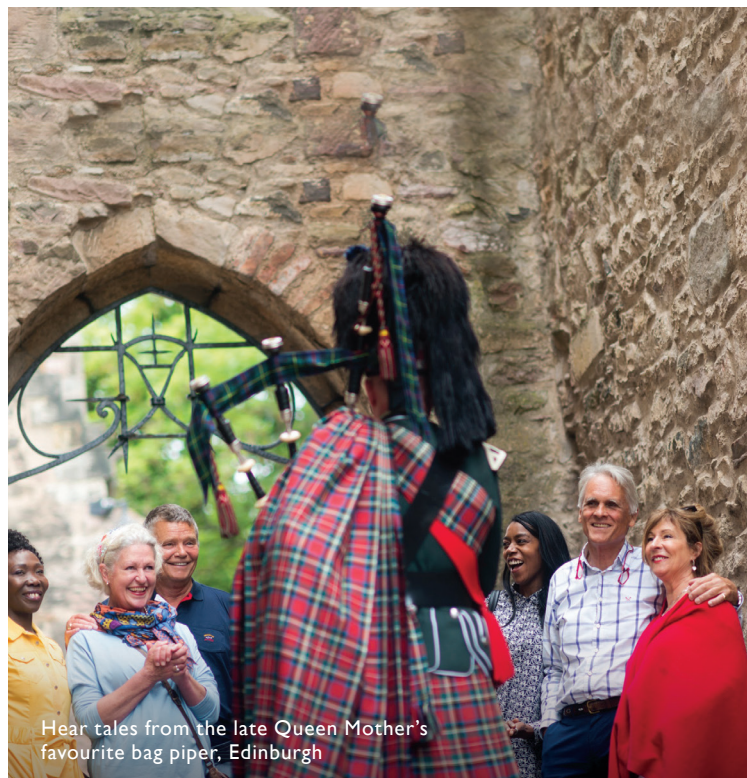
Hear tales from the late Queen Mother's favourite bag piper, Edinburgh